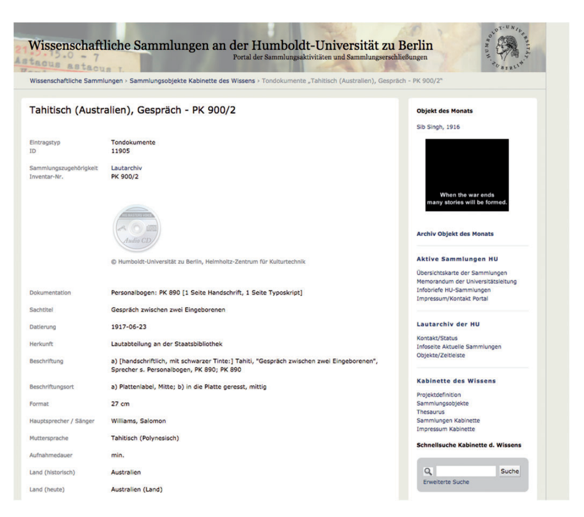
Fig. 1 A catalog entry (http://www.sammlungen.hu-berlin.de/dokumente/11905/) from the Humboldt Museum, Berlin, with Tahitian erroneously listed as an Australian language in the header, and later as a Polynesian language. There is no ISO-639-3 identifier provided for the language

names for each item, or surveyor's notebooks that include vocabulary from local languages. Each of these could be located by a researcher in the course of their work, but how can they then announce the language content in a way that would be located by others? What form could such an announcement take?